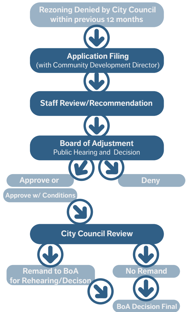
Figure 134-6.7-B. Zoning (Use) Variance Process