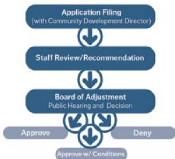
Figure 134-6.6-A. Type 2 Zoning Exception Process