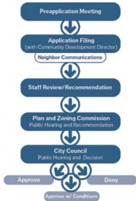
Figure 134-6.3-A. Zoning Map Amendment Process