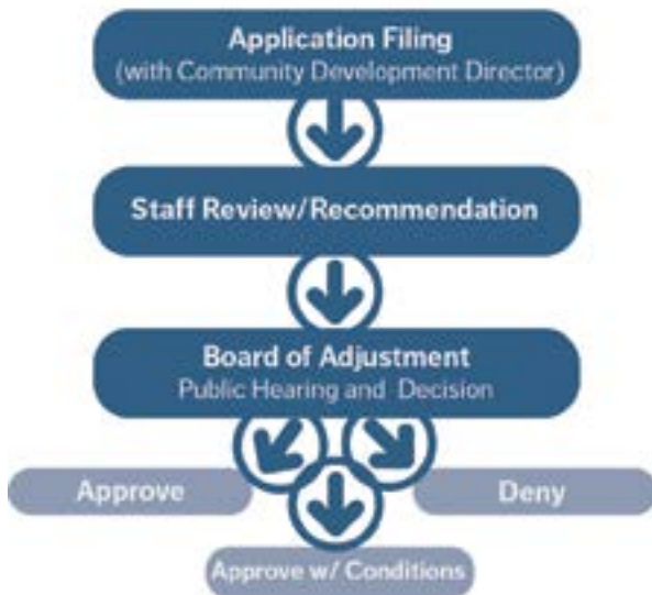
Figure 134-6.7-A. Zoning (Non-Use) Variance Process