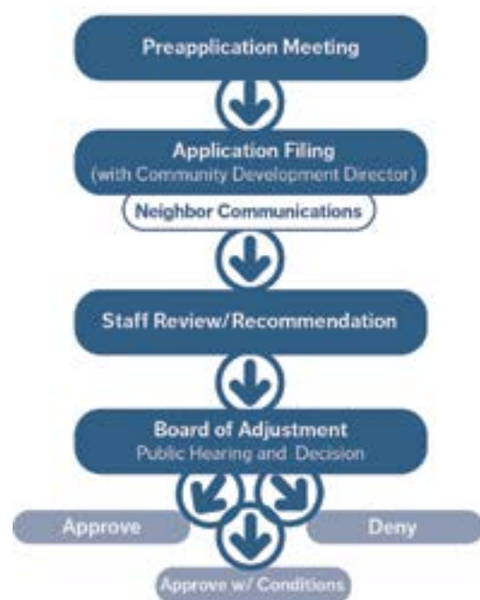
Figure 134-6.4-A. Conditional Use Process