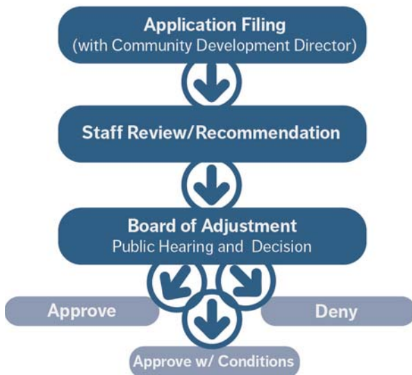
Figure 134-6.7-A. Zoning (Non-Use) Variance Process