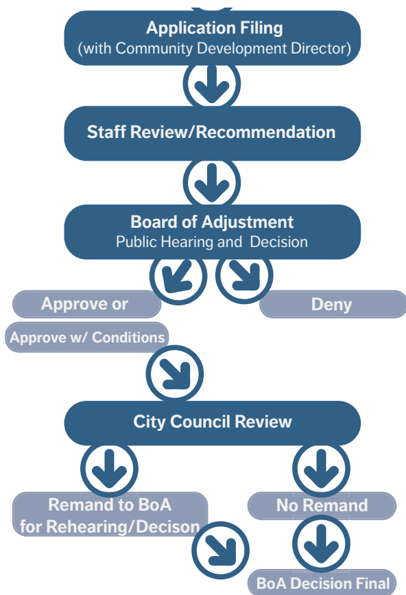
Figure 134-6.7-C. Zoning (Separation Distances) Variance Process