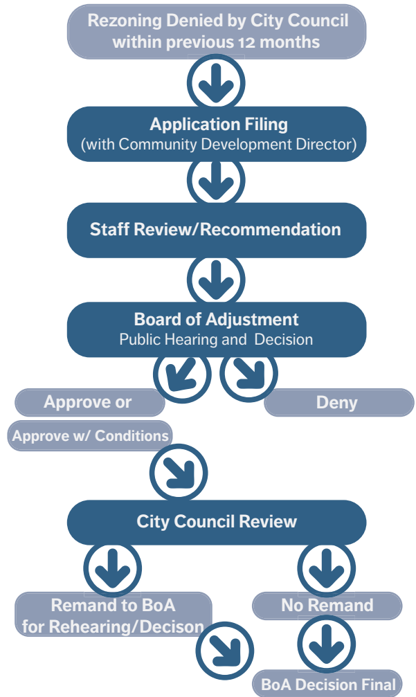
Figure 134-6.7-B. Zoning (Use) Variance Process