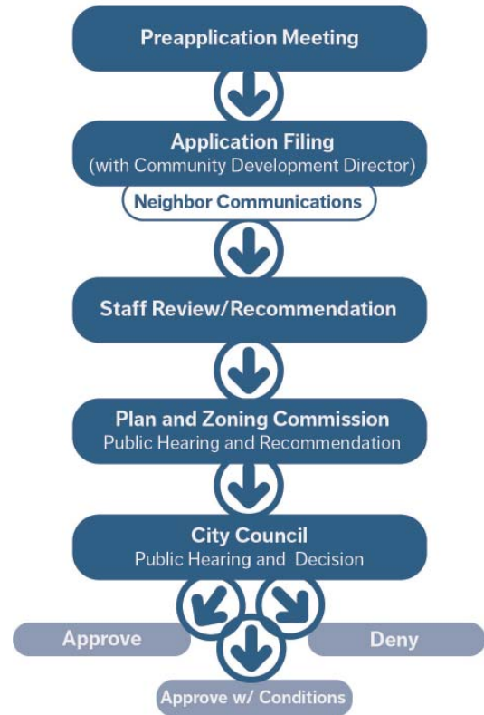
Figure 134-6.3-A. Zoning Map Amendment Process