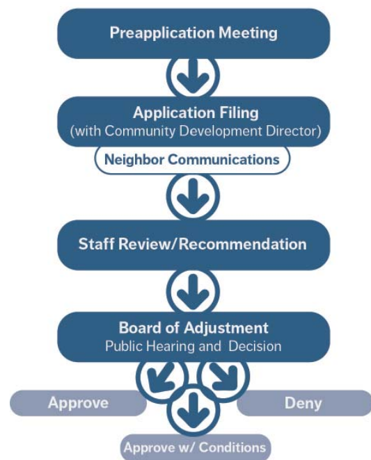
Figure 134-6.4-A. Conditional Use Process